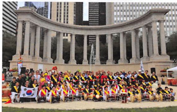
PROJECT UL-SSI-GU Celebration of Liberation Day of Korea, 8.15