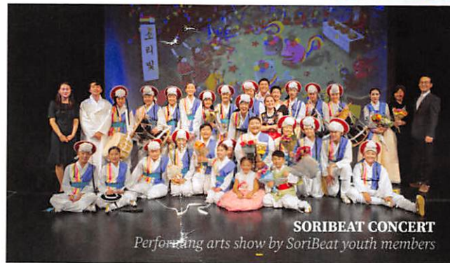
SORIBEAT CONCERT Performing arts show by Soribeat youth members